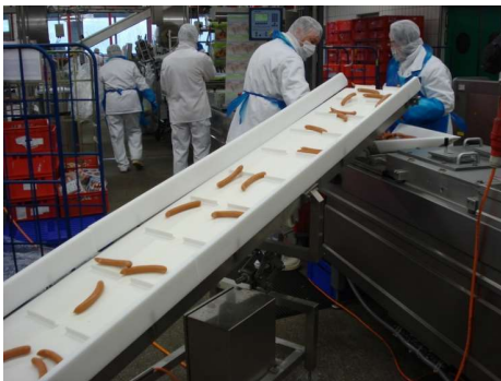
Feeding of the products from the de-clipper for insertion into the thermoforming machine.