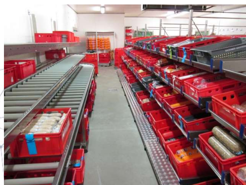
Picking warehouse with transportation of the picked goods to shipping area