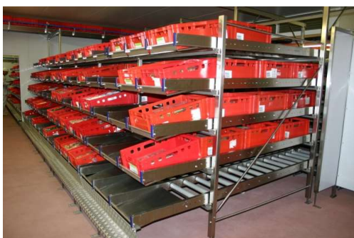
Conveyor rack for manual storage of Euronorm stacking crates according to the first-in first-out principle (FIFO)