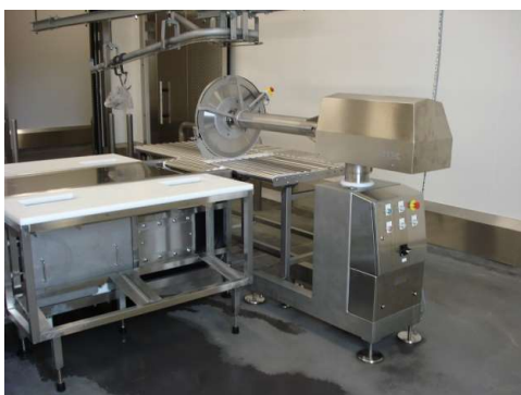
Semi-automatic slaughtering with a circular knife for clean, loss-free cutting of the cuts