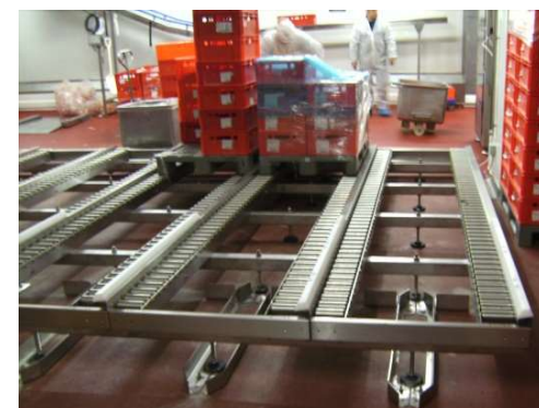
Rolled carpet for storage of whole pallets as ripening storage, buffer storage or for order picking of large quantities