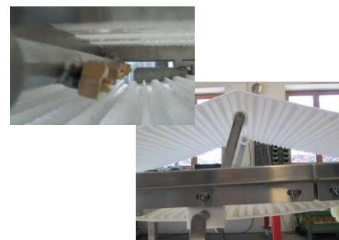
Support of belt cleaning by rinsing nozzles in the lower tower as well as lever for lifting the plastic belt