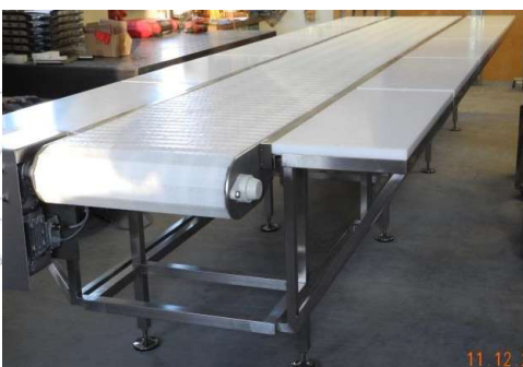
Cutting belt with plastic link chain and parallel arranged work tables