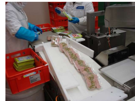
Packaging workplace: The thermoformed and price-labelled goods are bundled and packed in cardboard boxes.