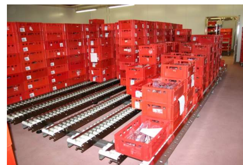
Wheeled carpet for storing stacks of containers as ripening stores or for order picking of large quantities