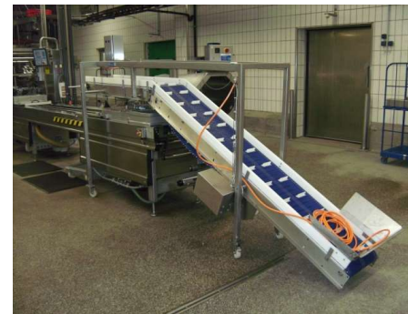
Feeding of the products into the loading area of the thermoforming machine as mobile version.