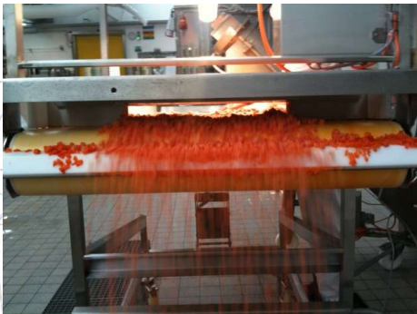
Sorting belt for vegetables for sorting out impurities by employees standing on the side of the belt or using a strong magnet.