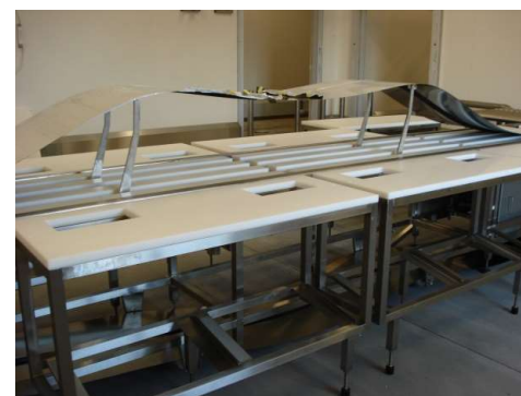
Cutting band with stainless steel band. A robust and easy to clean version for industrial use.