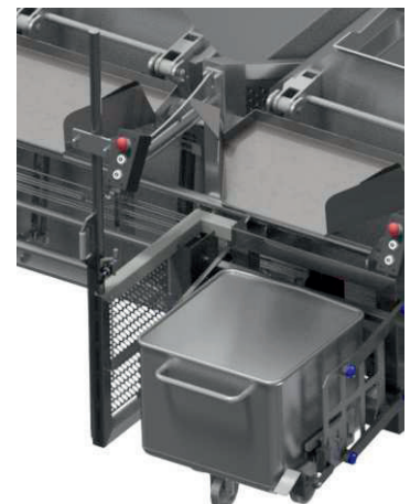
Pneumatic weighing trolley - optional integration by the customer desired terminal possible