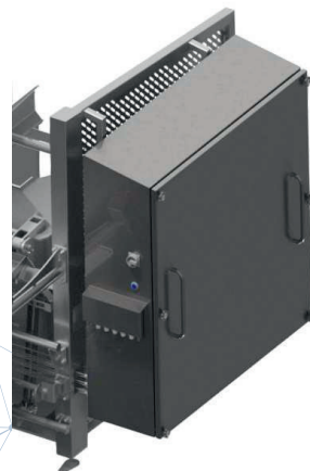
Control cabinet on the side, optionally on the right or left of the machine